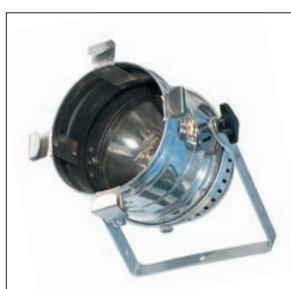
Reflector PAR64 500-1000W EUR 50.00 Cod 019.010.200.020