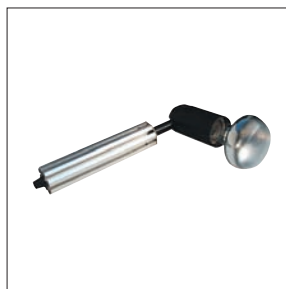
Lampa spot stut OCTANORM EUR 18.00 Cod 019.010.187.000