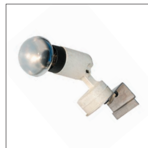
Lampa spot SS30 100W EUR 18.00 Cod 019.010.200.008