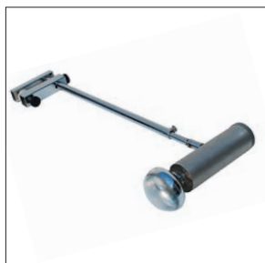
Lampa spot cu brat 100W EUR 18.00 Cod 019.010.181.000