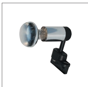
Lampa spot 100W EUR 18.00 Cod 019.010.188.000