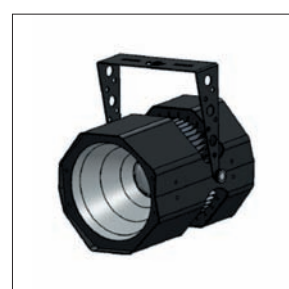
Reflector LED VIRGO 40W 4350 LM 4100 K EUR 50.00 Cod 019.010.200.045