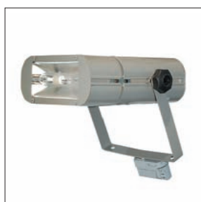
Reflector IVEN HQI 150W EUR 45.00 Cod 019.010.200.005