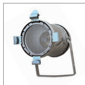
Reflector HIGHLITE HQI 150W EUR 45.00 Cod 019.010.390.000