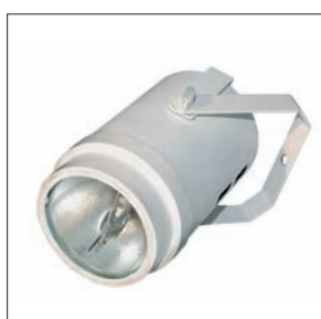
Reflector HQI 80W EUR 45.00 Cod 019.010.200.030