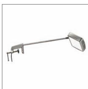
Reflector tija LED A++ 16W 1100LM 4000K ARM33CM EUR 45.00 Cod 019.010.200.040