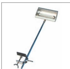
Reflector cu brat 300W EUR 45.00 Cod 019.010.200.010