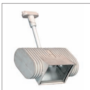
Reflector halogen SYMA STAR 300W EUR 45.00 Cod 019.010.200.006