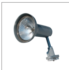
Spot halogen SY STAR 100W EUR 21.00 Cod 019.010.185.000