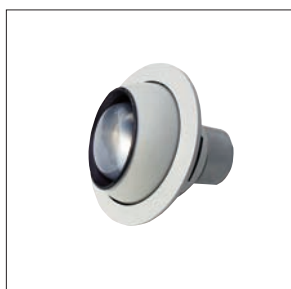
Lampa spot 100W EUR 18.00 Cod 019.010.170.000