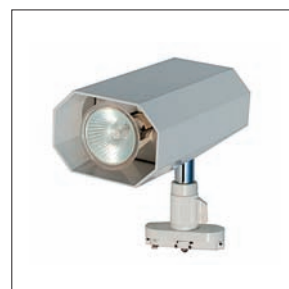
Spot halogen SY STAR 50W(A) EUR 21.00 Cod 019.010.186.000