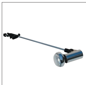
Lampa spot cu brat EUR 18.00 Cod 019.010.180.000